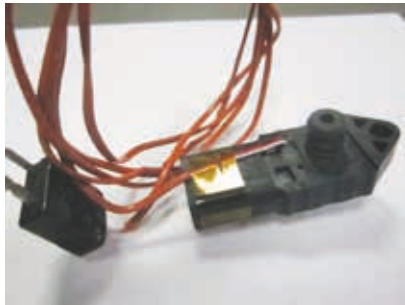
Figure 2. Thermocouple embedded into the gel of a specially modified part.

gels are typically dispensed at a lower viscosity to promote flow and complete coverage. After the material has been degassed and dispensed, it must be properly cured to achieve the final viscosity to protect the product. In order to establish the proper cure profile for the gel, as recommended by the manufacturer, it is necessary to characterize the process. A calibrated thermocouple reader and a fine wire thermocouple are used in order to characterize the specific cure oven profile. The fine wire thermocouple is embedded into the gel of a specially modified part (see Figure 2). The thermal gradient of the gel will always lag the thermal gradient of the cure oven. Cure characterization ensures a proper and complete cure of every part every time.