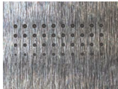
Figure 3. Shot weight test coupon.

fications. Gel dispense processes pose unique, but surmountable, challenges to quantification. At SMART Microsystems, highly accurate and precise measurement and dispense tools are used in the design, development, and production phases of gel encapsulation. The dispense process is designed using precise mass scales and with accurate programmable dispensing units to deliver a precise shot weight of gel material in every part (see Figure 3). This type of process design provides exceptional results with measurable outputs that can be controlled through statistical process control (SPC).