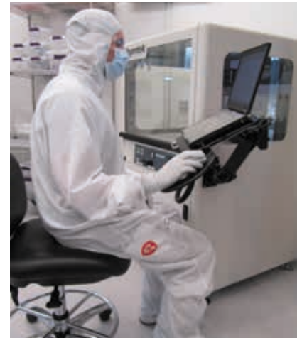
SMART's precision automatic dispense equipment.

fications. Gel dispense processes pose unique, but surmountable, challenges to quantification. At SMART Microsystems, highly accurate and precise measurement and dispense tools are used in the design, development, and production phases of gel encapsulation. The dispense process is designed using precise mass scales and with accurate programmable dispensing units to deliver a precise shot weight of gel material in every part (see Figure 3). This type of process design provides exceptional results with measurable outputs that can be controlled through statistical process control (SPC).